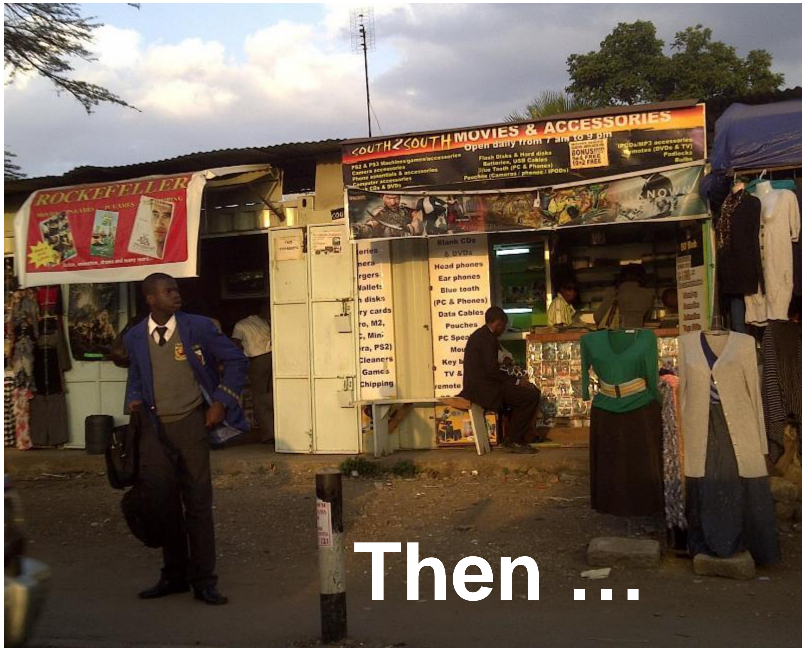
Nairobi digital accessories store, July 2011