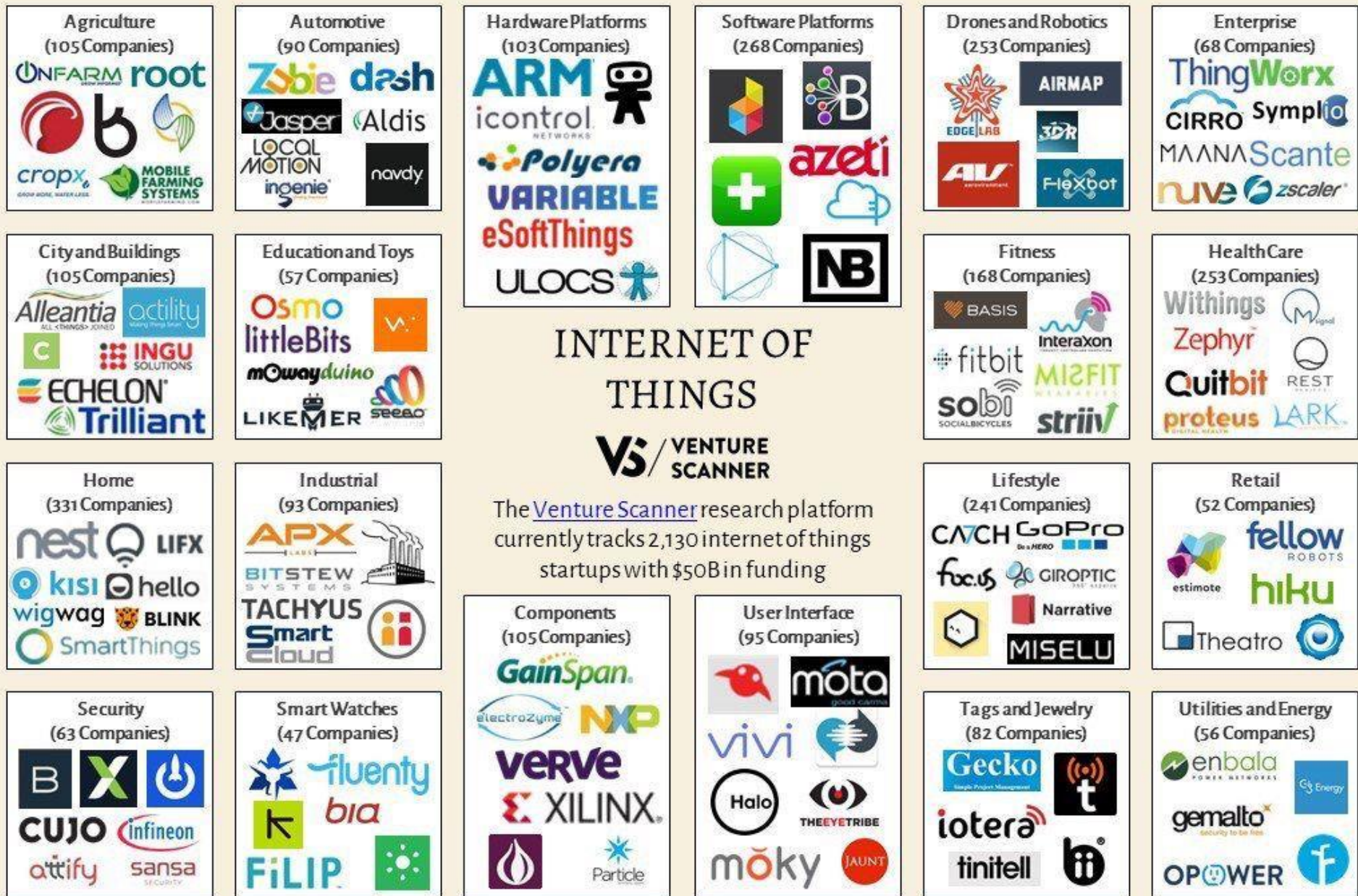
The graphic above shows a random sampling of companies in each category, data cumulative as of December 2017